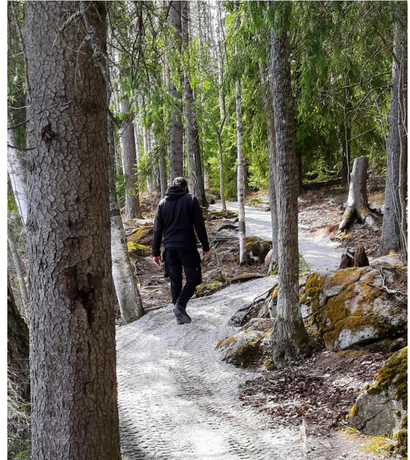
partly the path is made with gravel