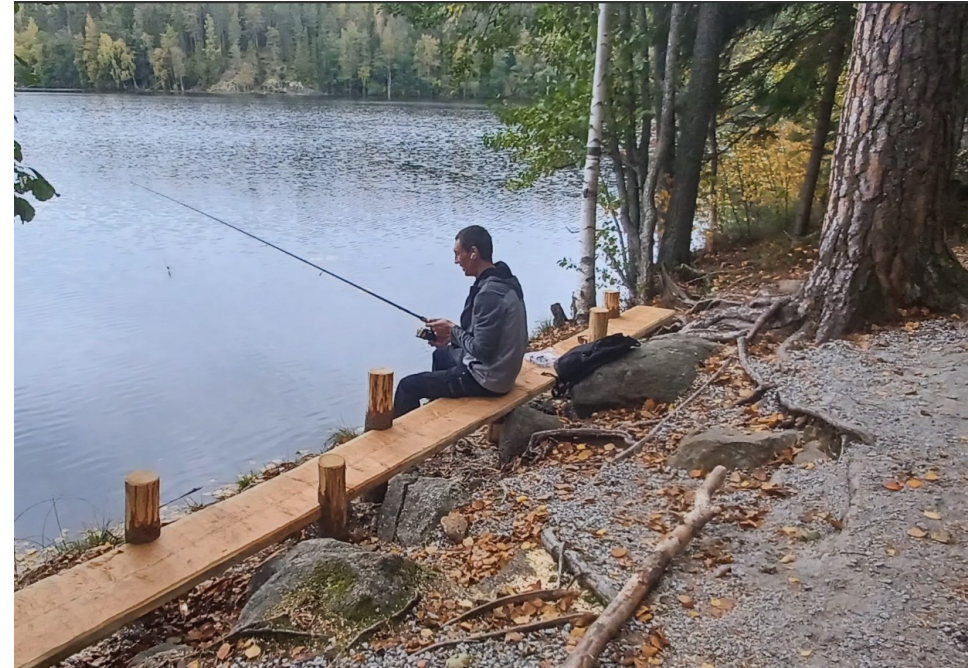
Finished Citizens' bench in use