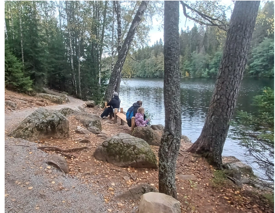
Citizens' benches were made in four different places