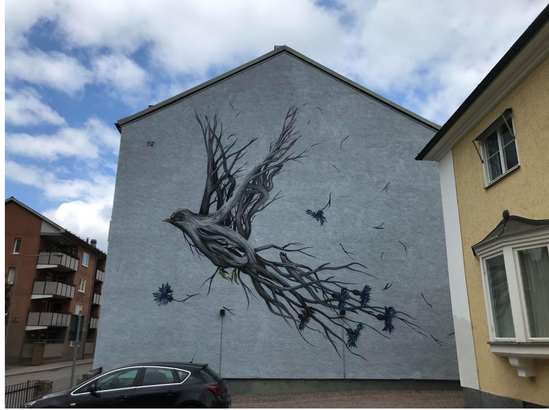
Artscape - public municipal art project 2020 Artist: Vegan Flava