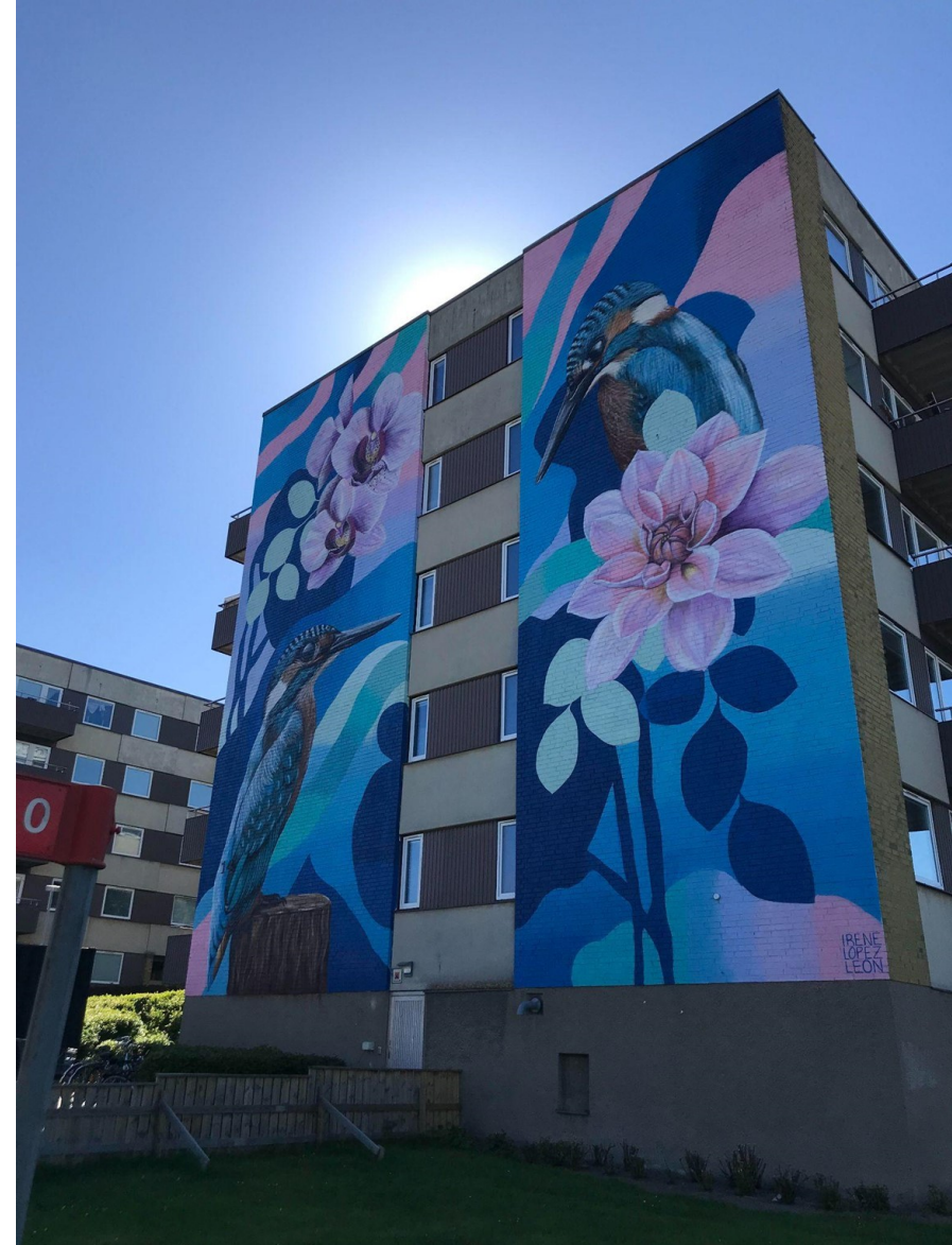
Artscape - public municipal art project 2020 Artist: Irene Lopez