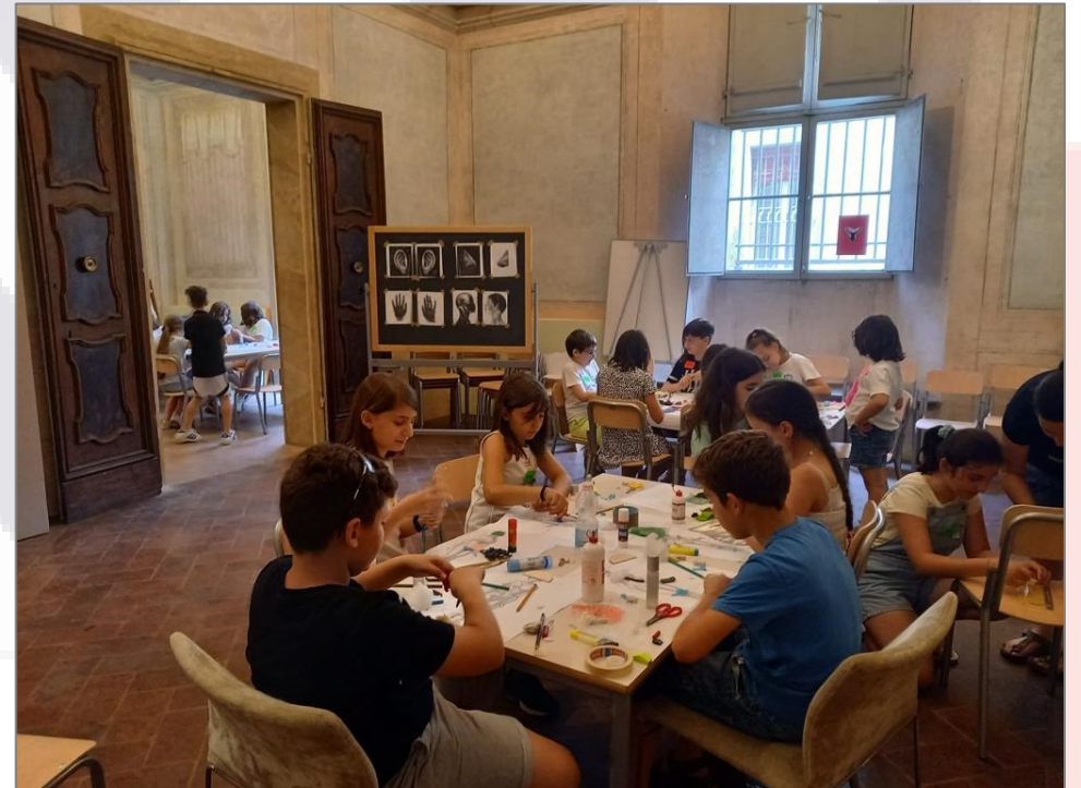
Civic Museums, Educational Activities