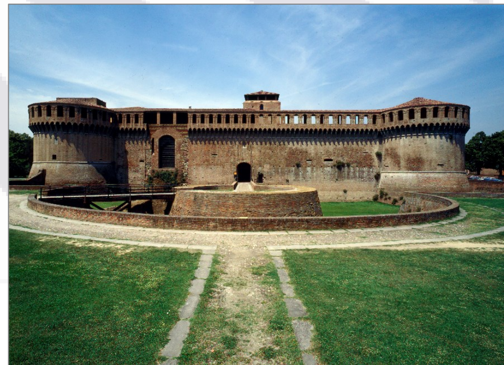
Civic Museums, Rocca Sforzesca