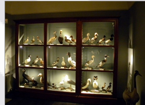
Civic Museums, Museum of San Domenico