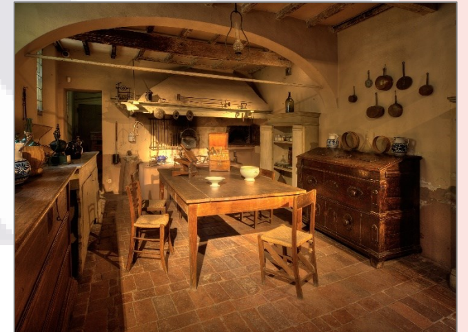
Civic Museums, Palazzo Tozzoni